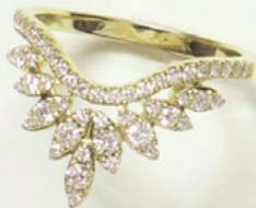
14K Yellow Gold .51ctw Diamond Vine Ring $1298