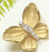
Simon G 18K Gold & Diamond Earrings $1166