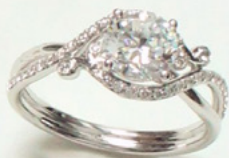
14K White Gold Vine Bypass Engagement Ring (Center not included) $1188