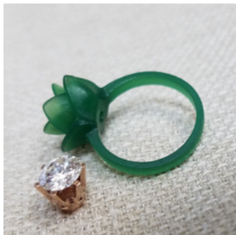
Hand-carved wax model

We had the privilege of creating this custom platinum and rose gold diamond flower ring for a special client. The ring has beautiful symbolism to her of new beginnings and a fresh start. We loved walking her through the design process and helping the ring of her dreams come true!