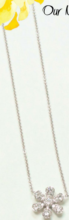
14K White Gold .48ctw Diamond Flower Necklace $1364