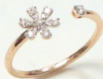
14K Rose Gold .14ctw Diamond Flower Ring $660