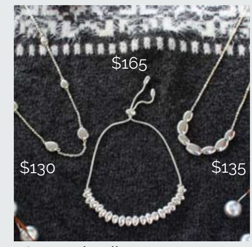
A trendy silver accessory for your friends, coworkers or teachers.

Coordinating flower necklaces for your young daughters or granddaughters.