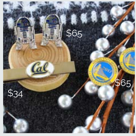
A tie bar or cufflinks for your brother, uncle or son.

We hope you will join us so that we can say thank you for your continued loyalty and celebrate this joyful time of year together!