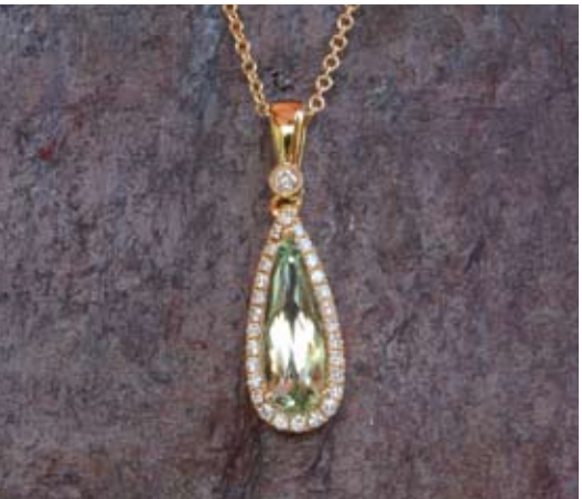
Clockwise from the top: Blue topaz and diamond ring $1350 / Morganite and diamond earrings $1575 / Green quartz and diamond necklace $1150 / Blue topaz earrings $575 / Simon G. vintage diamond necklace $3350